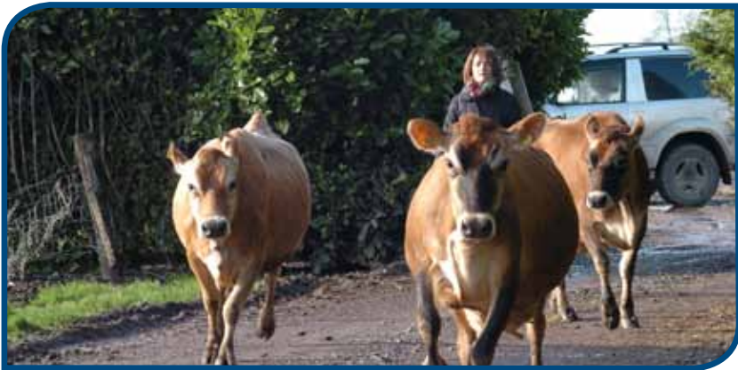
Training includes supports for on-farm enterprise

Meath Partnership is committed to creating and delivering new and relevant training programmes for rural entrepreneurs, communities and existing businesses. These training programmes are delivered at our training centre; the Dr Curran Centre of Learning, Kells Business Park and through a range of community-based outreach locations in Meath. Meath Partnership, working with leading training providers is delivering a series of training programmes and workshops including the following: